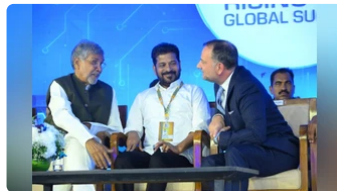
Trump Group to invest nearly ₹1 trillion in Telangana over 10 years