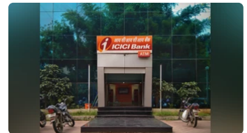
ICICI Bank to maintain over 51% stake in all 3 of its listed entities: ED