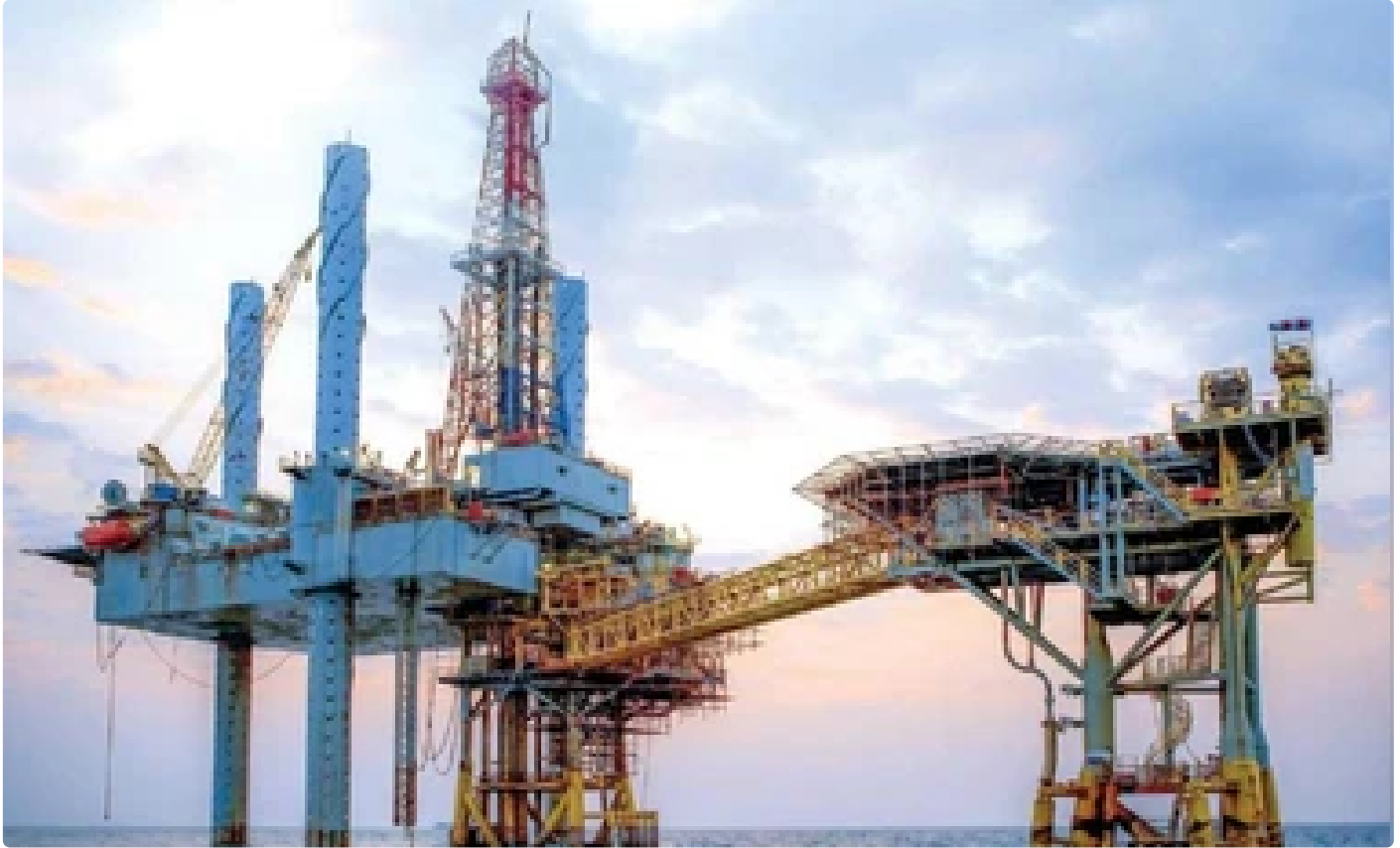
Cairn Oil & Gas

The partnership would follow a gain-sharing model based on recovery and production improvements, with the partner holding full ownership of the recovery enhancement projects, said Cairn Oil & Gas