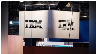
IBM boosts cloud computing push with nearly $11 billion Confluent deal